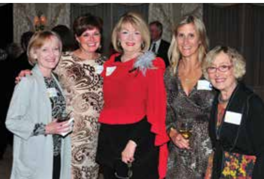
Members enjoy the Annual Meeting and Appreciation Dinner