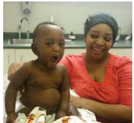
1 year-old patient with his mom at a well-child visit

While it is still too soon to gauge the effect of the state's move to MCOs and ACE's on our patient census and revenue stream, one thing is clear: the new system has increased administrative costs without an increase in reimbursement levels. Additional reimbursement reduction proposals under consideration in Springfield will also negatively impact our bottom line.