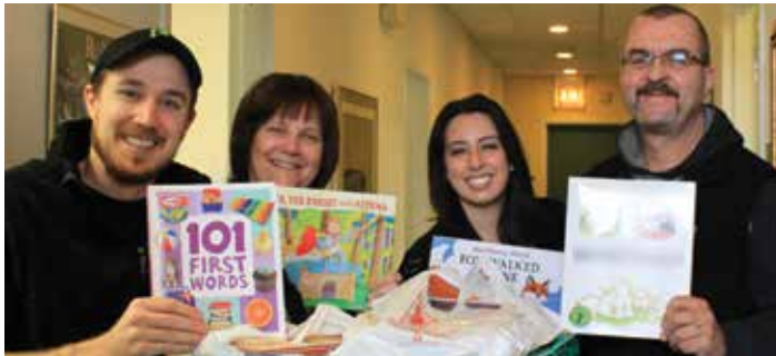
Bernie's Book Bank delivers 12 bins of new books

The Children's Clinic is taking it to the bank – Bernie's Book Bank, that is.