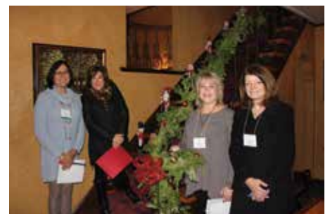
Housewalk Docents greet visitors