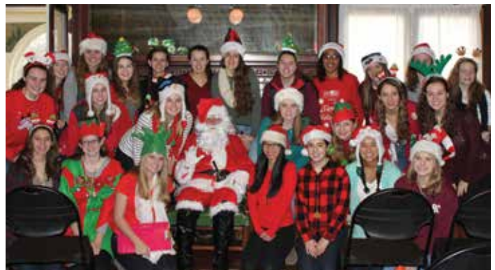
Circle 80 hosting the Children's Holiday Party